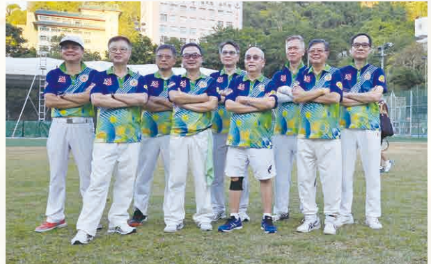
Men Division 4 – Champion – YLLBC-A