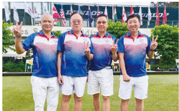
Men Division 6 - Champion Team – CdeR