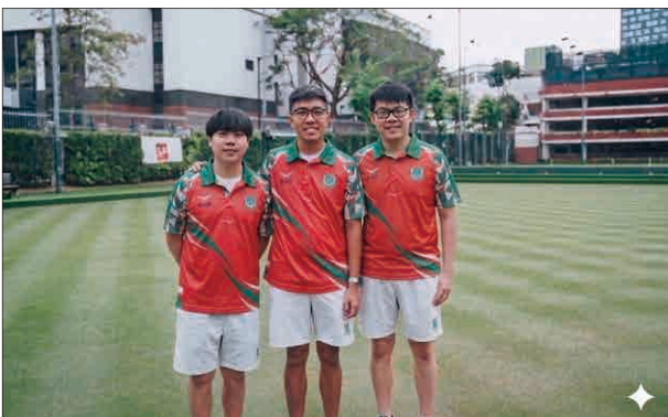
Men Division 1 - Champion Team – KCC