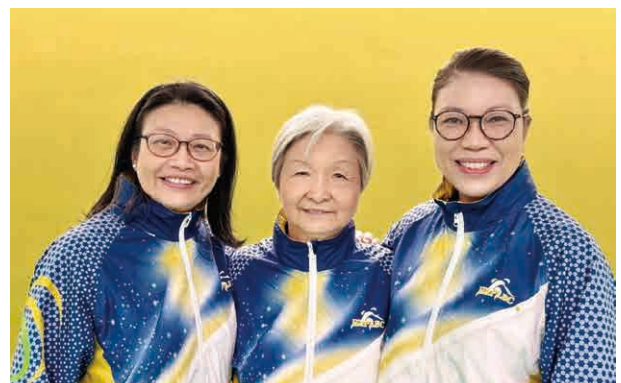
W Division 6 – Champion Team – HKPBC