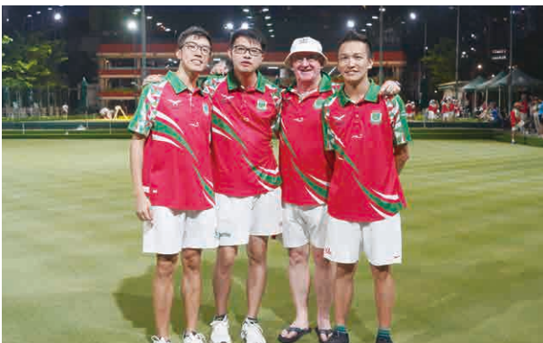
Men Division 1 - Champion Team – KCC