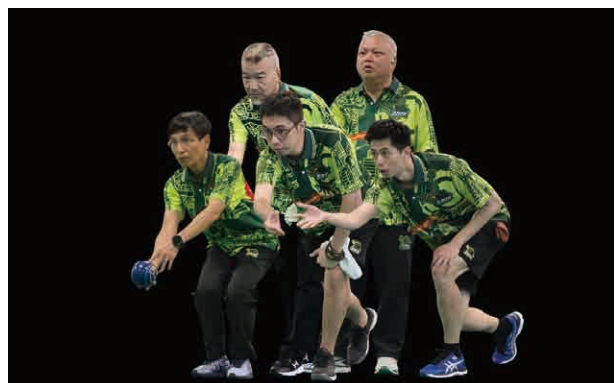
Men Division 10 - Champion Team – SBIA