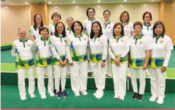
W Division 5 – Champion – ABC-B