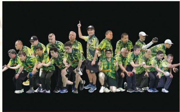
Men Division 10 – Champion – SBIA-A