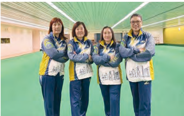
Women Division 5 - Champion Team – HKPBC