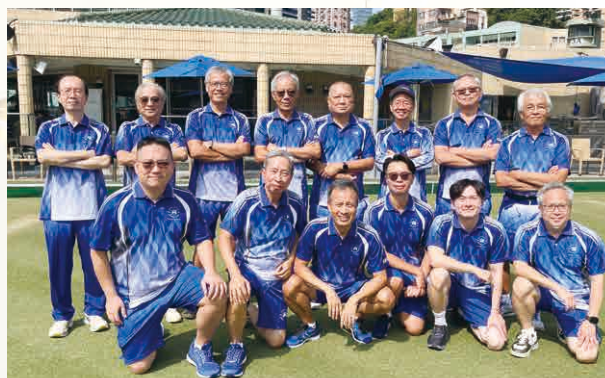
Men Division 4 – Champion – HKFC-D