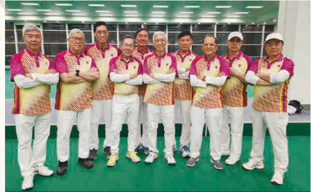
Men Division 8 – Champion – GBLBC-C