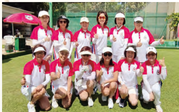
Women Division 2 – Champion – KBGC-A