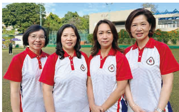
Women Division 2 - Champion Team – KBGC