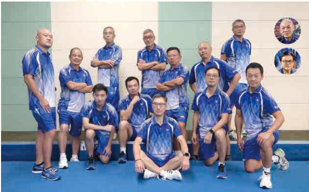
Men Division 1 – Champion – HKFC-C