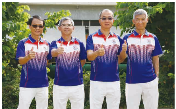
Men Division 2 - Champion Team – CdeR