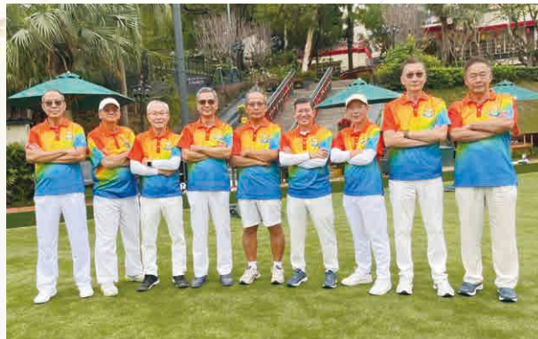
Men Division 10 – Champion – BFC-A