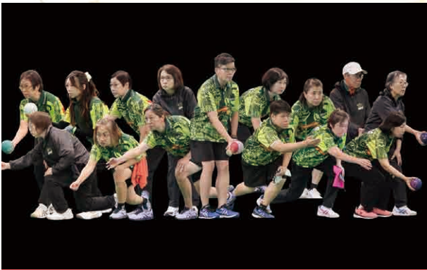
Women Division 7 – Champion – SBIA-A