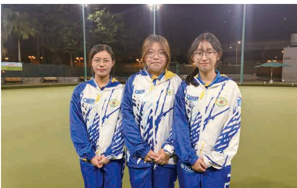
W Division 1 – Champion Team – YDT