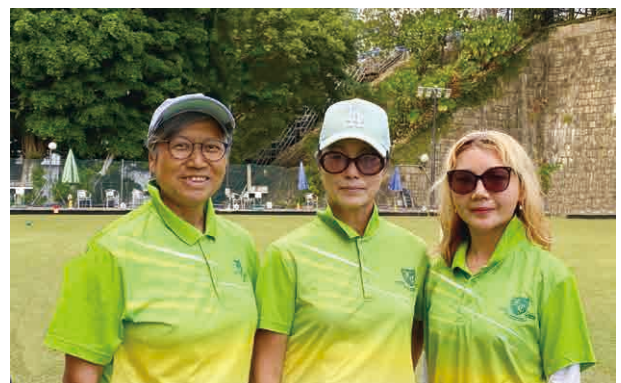
W Division 2 – Champion Team – FC