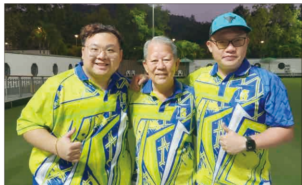
Men Division 2 - Champion Team – TKOBC