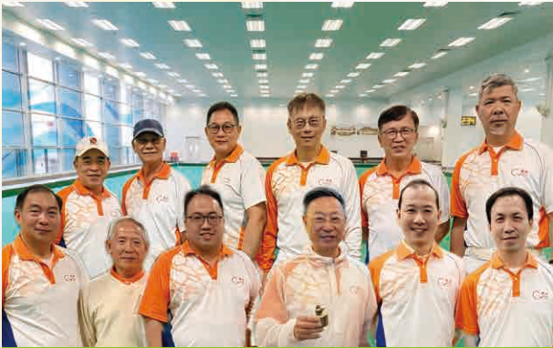
Men Division 13 – Champion – SBSC-C