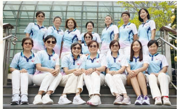
Women Division 4 – Champion – AYFP-A