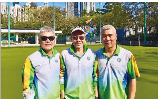
Men Division 5 - Champion Team – VLBC