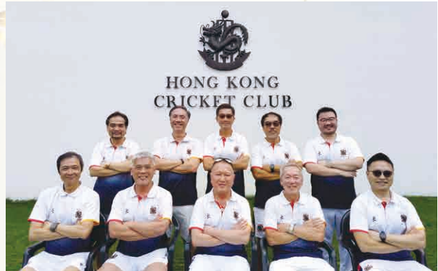
Men Division 6 – Champion – HKCC-B