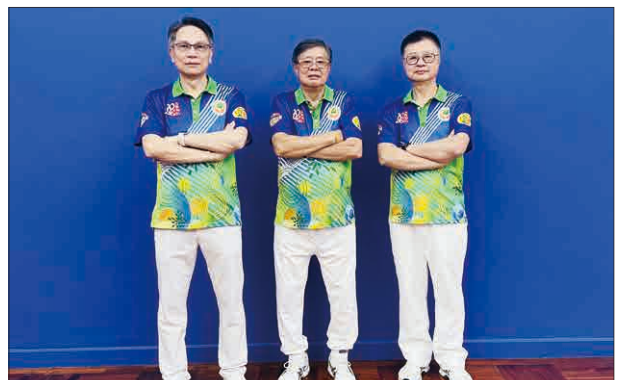
Men Division 4 - Champion Team – YLLBC