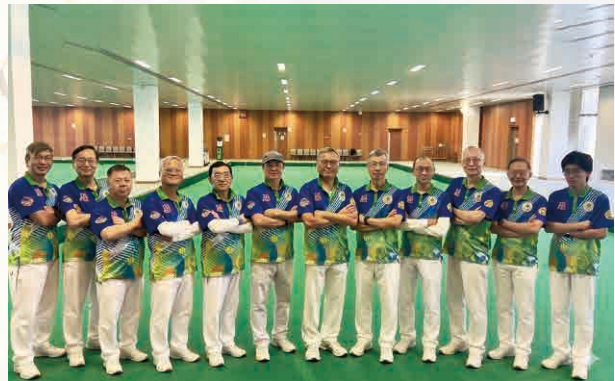
Men Division 6 – Champion – YLLBC-B