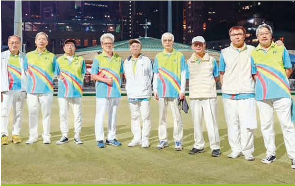
Men Division 11 – Champion – FPLBA-A