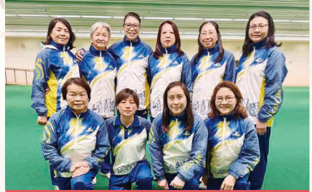
W Division 6 – Champion – HKPBC-B