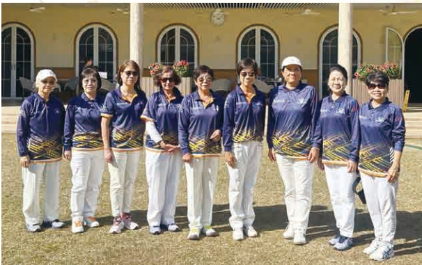
Women Division 3 – Champion – IRC-A