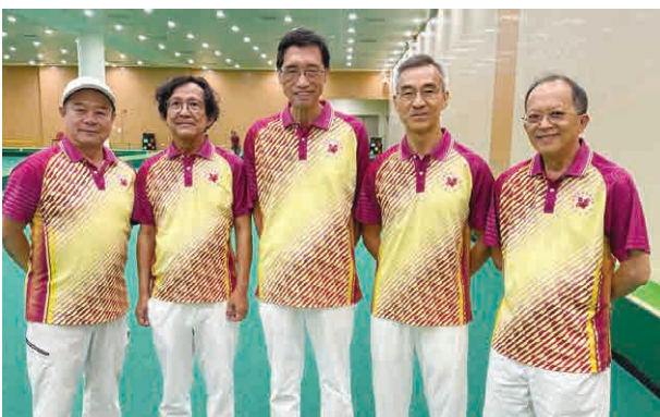
Men Division 9 - Champion Team – GBLBC