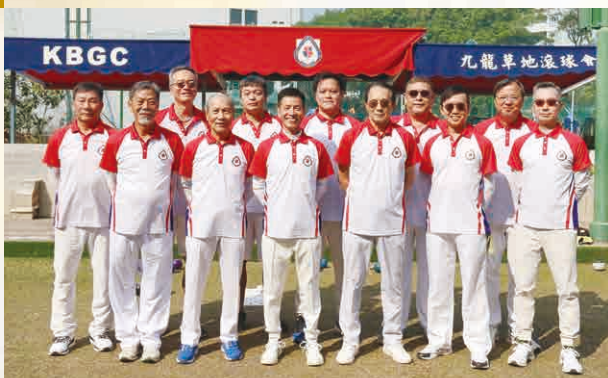
Men Division 3 – Champion – KBGC-B