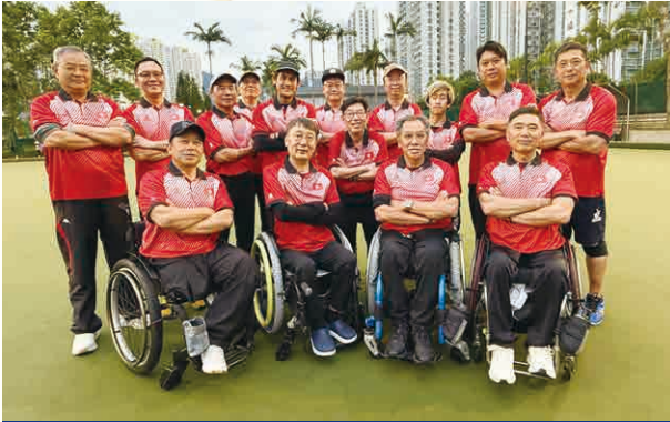
Men Division 7 – Champion – HKSAP-A