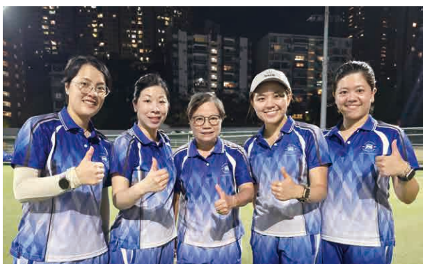
Women Division 1 - Champion Team – HKFC