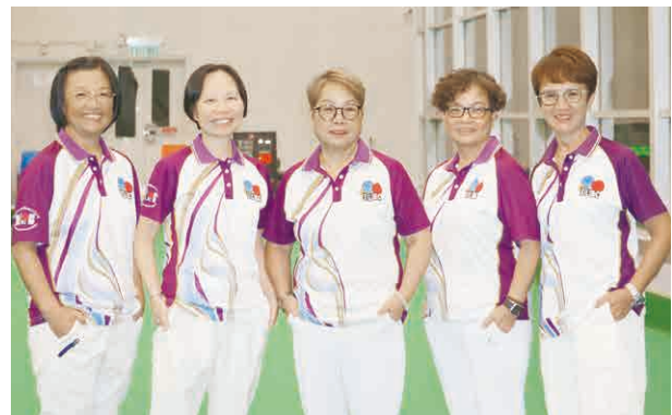
Women Division 4 - Champion Team – ILBC