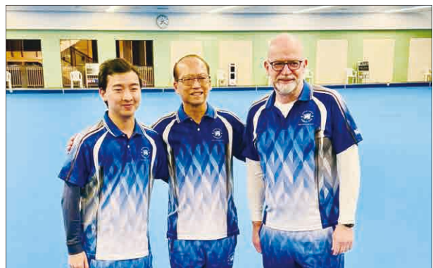
Men Division 6 - Champion Team – HKFC