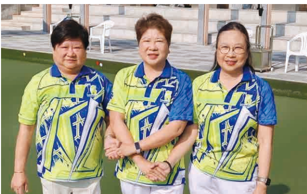
W Division 5 – Champion Team – TKOBC