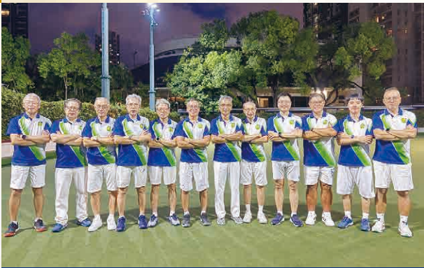
Men Division 7 – Champion – TVLBC-A