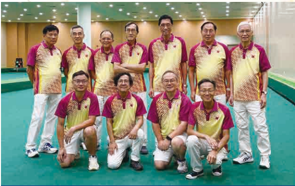
Men Division 9 – Champion – GBLBC-C