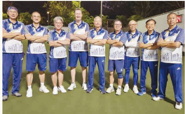
Men Division 2 – Champion – HKPBC-A