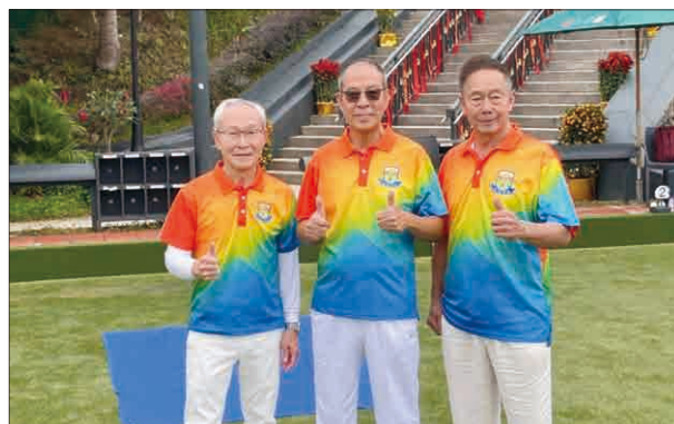
Men Division 10 - Champion Team – BFC