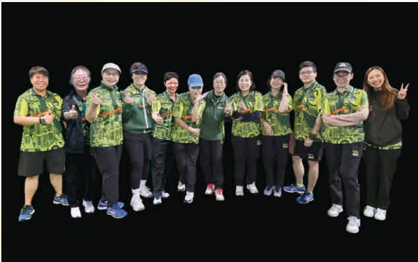
W Division 7 – Champion – SBIA-A