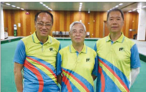
Men Division 11 - Champion Team – FPLBA