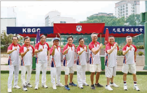
Men Division 3 – Champion – KBGC-B