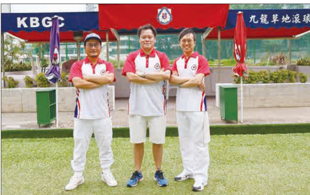
Men Division 3 - Champion Team – KBGC