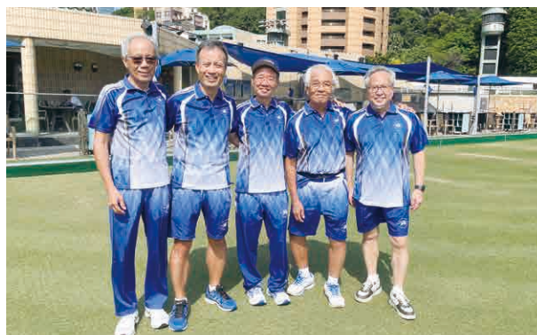
Men Division 4 - Champion Team – HKFC