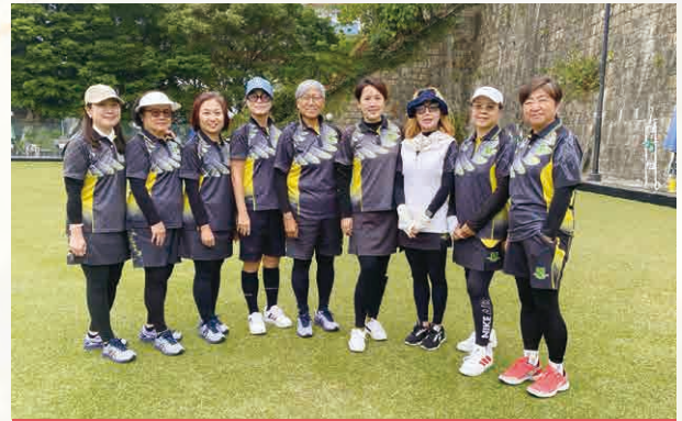
W Division 2 – Champion – FC-A