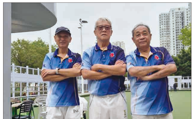
Men Division 12 - Champion Team – TMSA