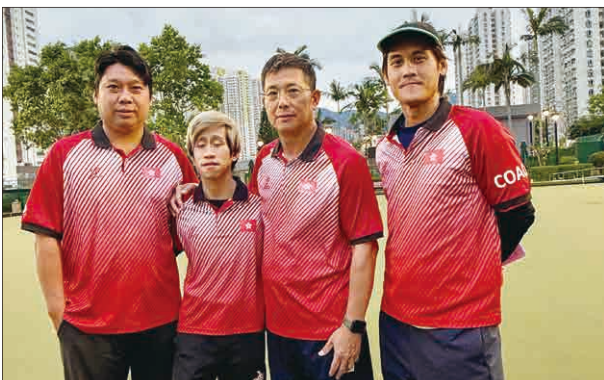
Men Division 7 - Champion Team – HKSAP