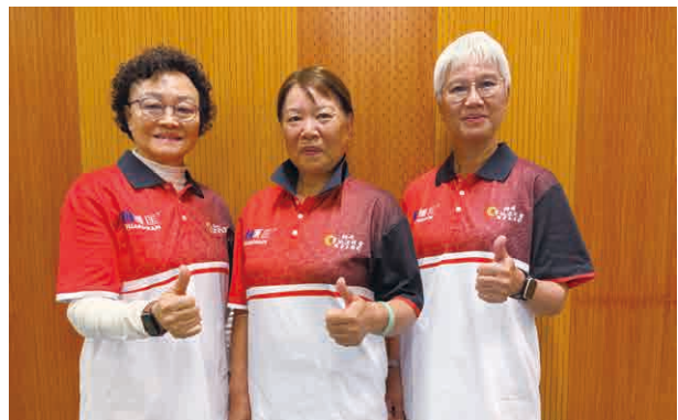
W Division 8 – Champion Team – KFLBC