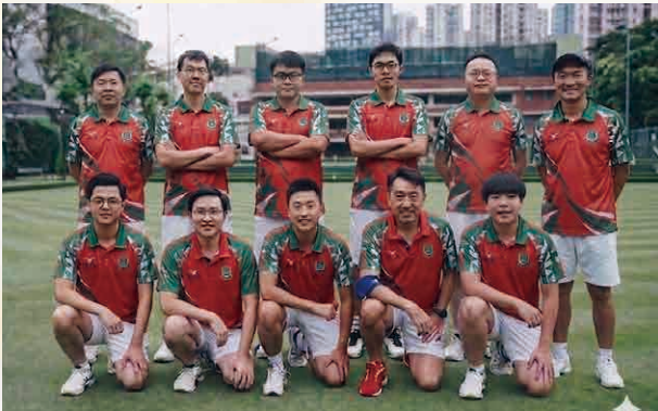
Men Division 1 – Champion – KCC-A