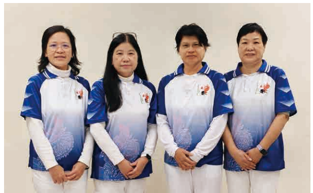
Women Division 6 - Champion Team – CLBC