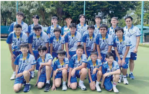
Men Division 5 – Champion – YDT-B