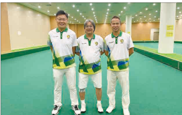
Men Division 9 - Champion Team – ABC