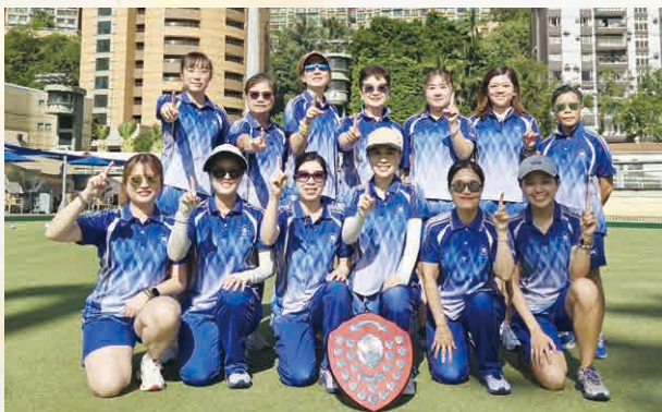
Women Division 1 – Champion – HKFC-A