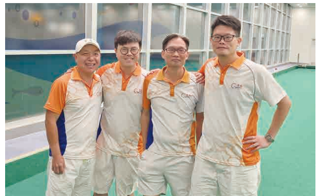
Men Division 8 - Champion Team – SBSC