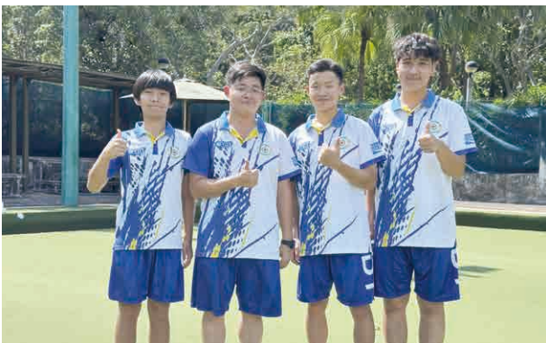
Men Division 5 - Champion Team – YDT