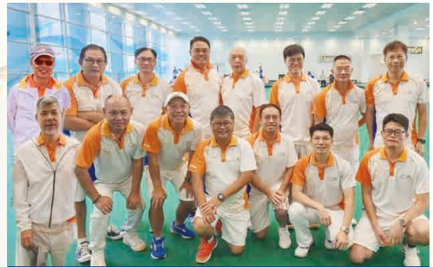
Men Division 8 – Champion – SBSC-B