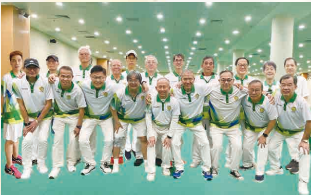
Men Division 9 – Champion – ABC-B