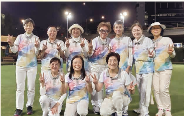
W Division 3 – Champion – USRC-A