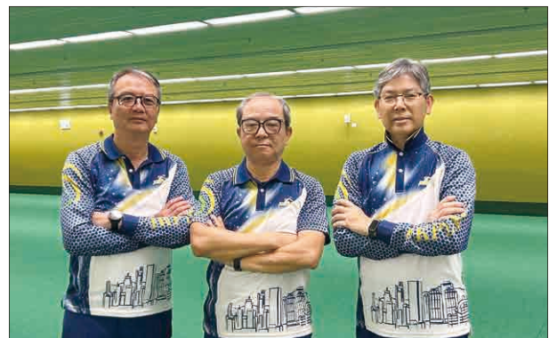
Men Division 8 - Champion Team – HKPBC