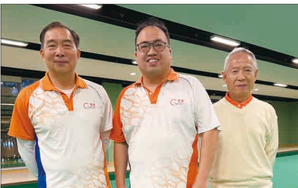
Men Division 13 – Champion – SBSC