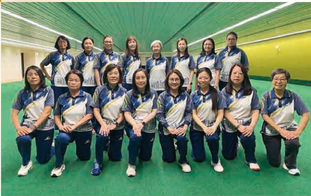
Women Division 5 – Champion – HKPBC-B