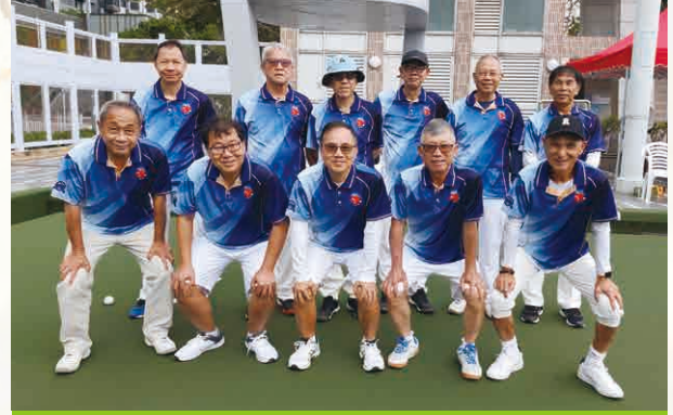
Men Division 12 – Champion – TMSA-G