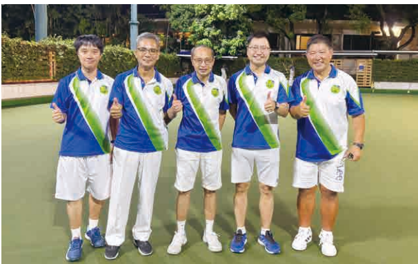
Men Division 7 - Champion Team – TVLBC