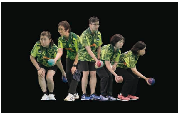
Women Division 7 - Champion Team – SBIA