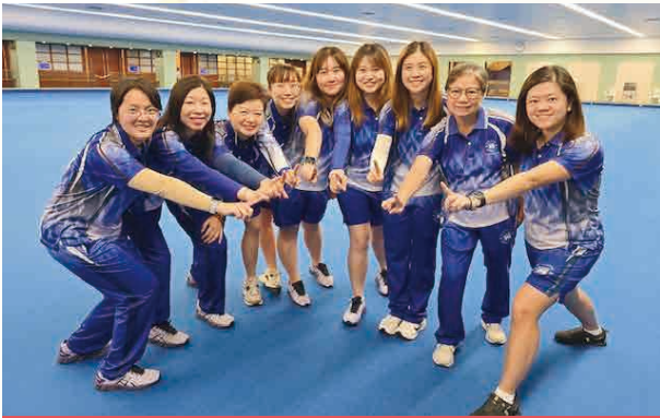
W Division 1 – Champion – HKFC-A