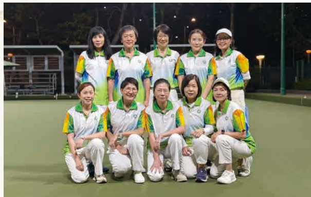
W Division 4 – Champion – VLBC-A