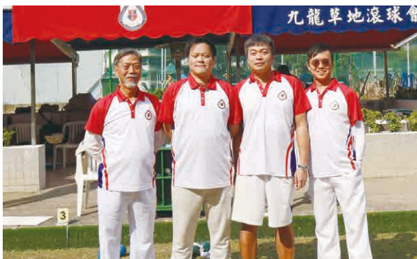
Men Division 3 - Champion Team – KBGC