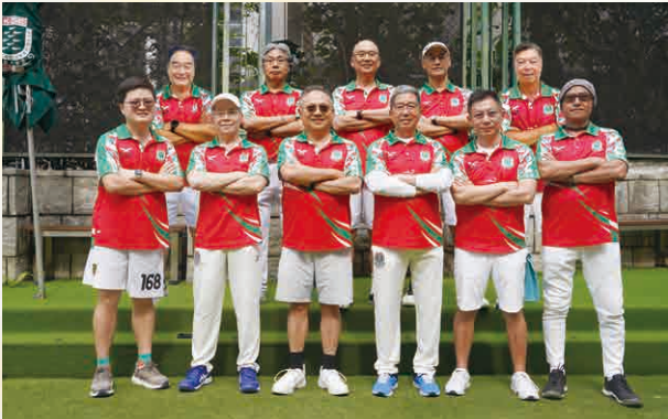
Men Division 5 – Champion – KCC-C